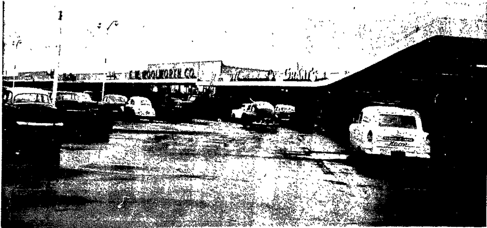
Section of Northern Lights shopping center at Pitcher Hill which officially opens with ceremonies at noon tomorrow

The opening of the Northern Lights, a shopping center at the Pitcher Hill traffic circle, by a ceremony at noon tomorrow, marks the latest major addition to Greater Syracuse trade facilities.