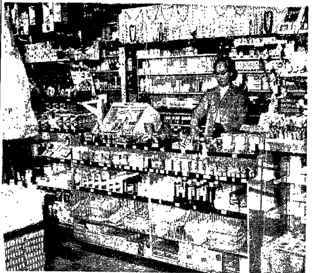
Stocked and ready for opening is Daw's Drugs

"Exceptional balance arises from presence of high grade industrial plants nearby, accessibility for rural and suburban customers and wide range of