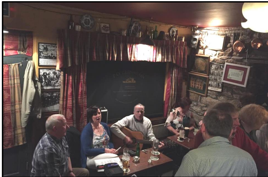
A session of traditional music at Kinnane's

The girls meet Bob here shortly after arriving in Upperchurch. He tries to recruit them into becoming Chemistry majors. Bob pointed out that all the skills that made them excellent investigators and mysteries solvers would be just what they needed to succeed in science.