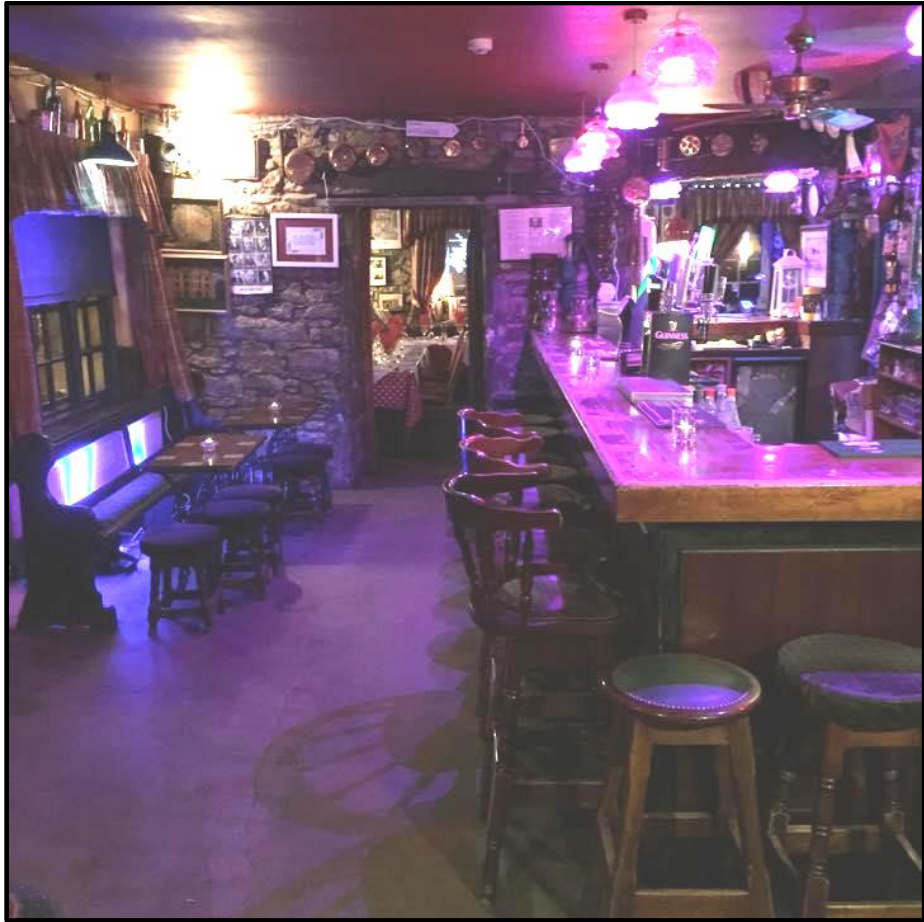
Internal view of Kinnane's Pub, Upperchurch