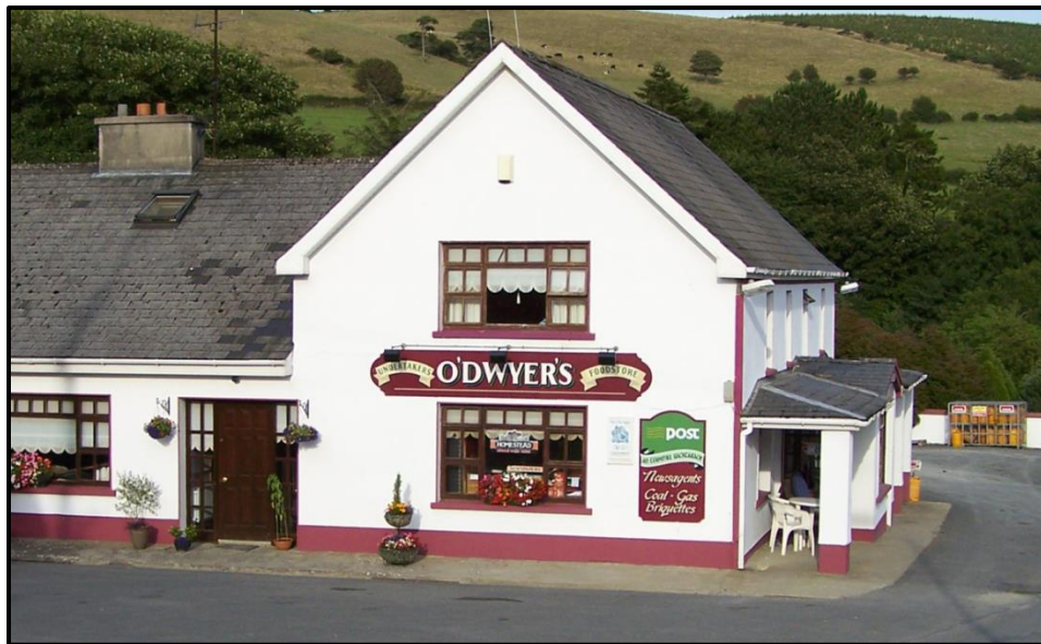
June 2006 - O'Dwyer's, located across the street from the graveyard. It is a grocery store, post office and undertaker all under one roof. And no, they don't use a common refrigerator — anymore.