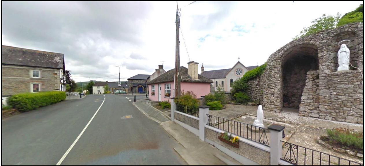
June 2009 - Looking northeast, along the main street through the village of Upperchurch. Kinnane's pub (not visible) is on the left side of the street near the end. Also to the left and out of the picture, directly across the street from the shrine (on the right of the picture), is the entrance to the village graveyard. Peering out from behind the small pink building is the Sacred Heart Church, built in 1929. The stone grotto on the right side of the picture was dedicated in 1967 to the memory of the deceased members of the 3 rd Battalion of the 2 nd or Mid Tipperary brigade which fought during the War of Independence.