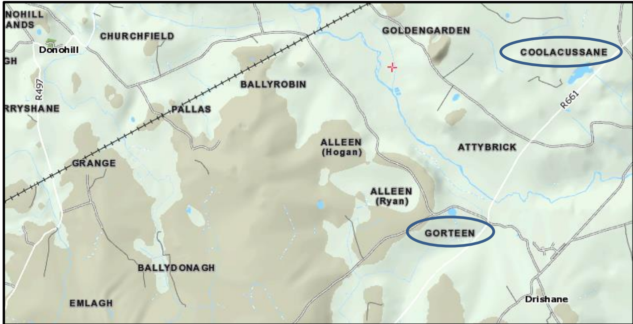
This map shows the townlands of Coolacussane and Gorteen which are both in Kilpatrick civil parish and Anacarty & Donohill RC parish.